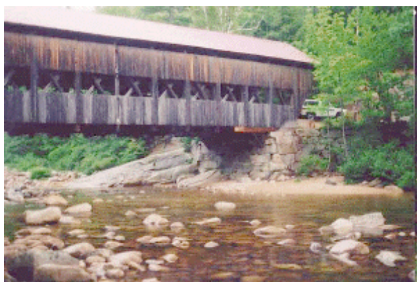
Albany Covered Bridge; View from the Saco river bed

Albany Covered Bridge—Albany: The first covered bridge in this spot blew down in 1857 before it was ever completed. The next year Amzi Russell and Leander S. Morton agreed to rebuild it for $1,300 less anything that had been paid on the previous structure. The bridge is 120 feet long with a 16 foot roadway, and is a long truss with added arch. The forest Serv-