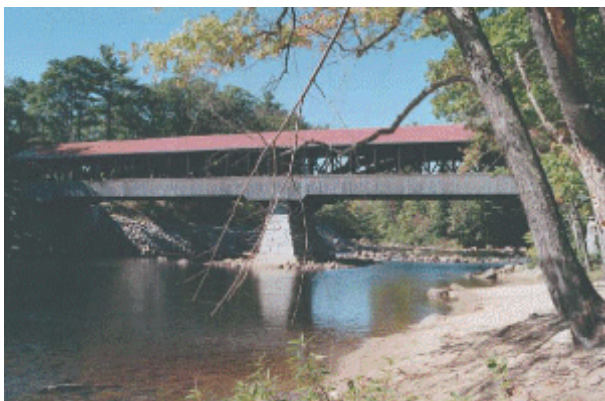
Saco River Covered Bridge; View from the Saco river bed

Saco River Covered Bridge—Conway: The third bridge on this site, this 2-span paddleford truss bridge is 244 feet 9 inches long. It was built in 1890 by Charles and Frank Broughton of Conway at a cost of $4,000; the arches were added later. New Hampshire Department of Transportation reconstructed it in