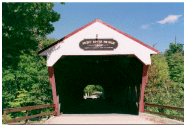
Bartlett Covered Bridge;

Bartlett Covered Bridge—Bartlett: The actual date this bridge was constructed is unknown, although it was built sometime in the 1800's, and is dated by some as