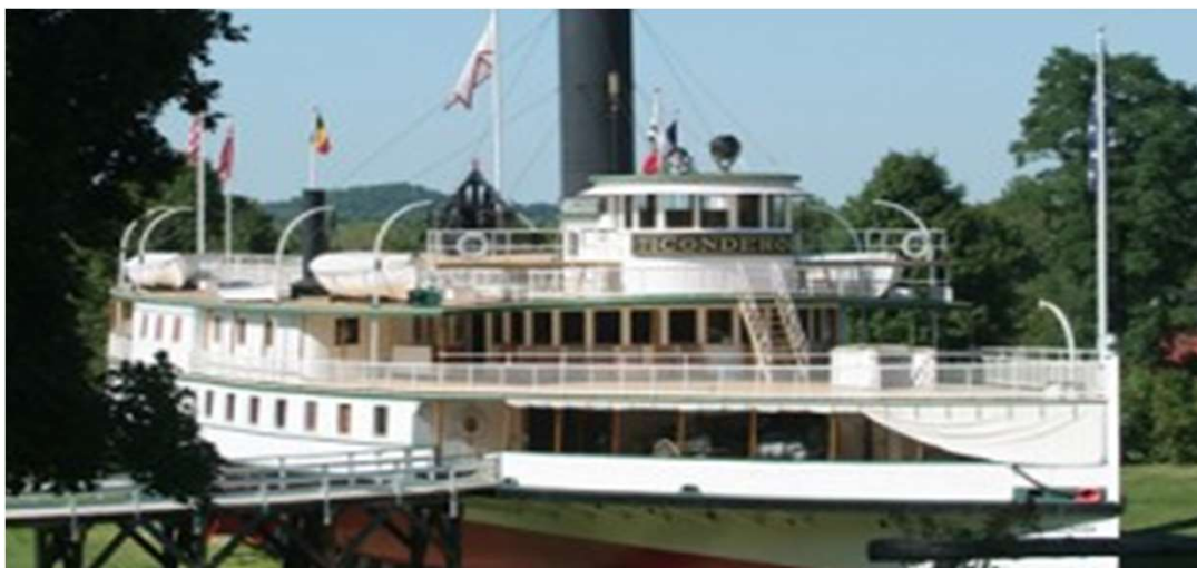
SHELBURNE MUSEUM "THE TICONDEROGA" STEAMBOAT