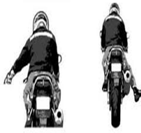
Left Hazard In Roadway